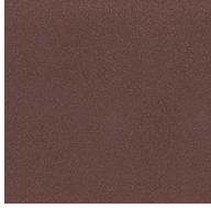
Rusty Angel - 09 (RUA)