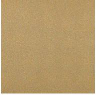
Jazz Gold - 29 (JAG)