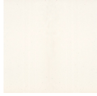
Creamy - 04 (CRY)