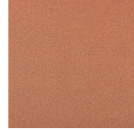
Copper Mine - 27 (COM)